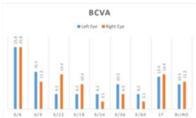
Figure 2: BCVA of both eyes