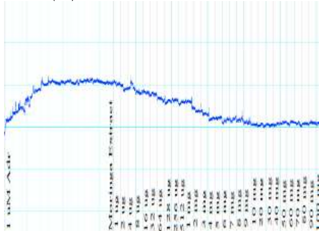
Fig. 1a: Effect of M. oleifera extract on aorta pre-treated with 1 µM Adrenaline (n=6)