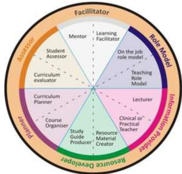
Figure 3: 12 Roles of Medical Teacher