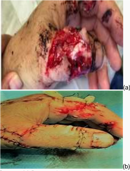
Figure 2: Case 8. (a) Pre-operative photograph of exposed dorsal thumb injury. (b) Post-operative photograph displayed flap was transferred to reconstruct the thumb's dorsum. A skin graft were used to cover the donor site. Postoperative photos taken 3 to 5 months after surgery show good flap mobility.