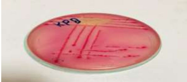
Figure 1: Pink mucoid colonies on MacConkey agar of Klebsiella pneumoniae

Occurrence of K. pneumoniae in Burn wound patient: Out of 50 samples from burn wounds of patients, 14 samples were positive for K. pneumoniae which make 28% occurrence and 36 were both Gram positive and other gram bacteria.