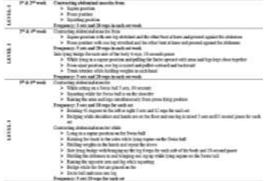
Figure 1: Trunk Stabilization Exercises Protocol

Static and Dynamic Sitting Balance: Static balance, when defined, is the capability of child to uphold the body at rest while being in any stable or fixed posture and to carry postural alignment in coordinated and stabilized way keeping center of mass within base of support<sup>24</sup>.On the other hand, dynamic posture has been quiet challenging for children with cerebral palsy, capability to fluctuate the center of gravity within vertical projection around line of gravity and base of support. In short, to maintain body posture with well oriented balance and coordination keeping it within base of support while it is in motion, is referred to as dynamic balance<sup>25</sup>. Statistical analysis: Using SPSS 23, data analysis was executed. Demographic data was computed using mean and standard deviation to interpret the descriptive statistics. For quantitative data, mean and standard deviation were preferred execution while qualitative categorical data has been presented in the form of percentage or frequency table if applicable. Shapiro-wilk test has been used to assume normal distribution of data. After assuming normality, parametric hypothesis testing was considered and independent sample t test was used to assess mean difference between groups while within subject variance, time effect and interaction effect, repeated measure ANOVA test was used. Pvalue<0.05 was considered significant to reject null hypothesis.