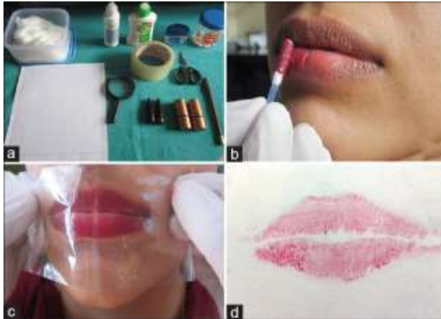
Figure 1: illustrates how Lip prints were divided into four quadrants for analysis