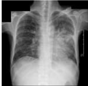
Fig. 1: Chest X- ray AP supine view, which shows bilateral hilar lymphadenopathy and consolidation of the left lower lobe.

He presented again 3 years later with symptoms of chronic productive cough for 3 months. Ziehl–Neelsen smear was found to