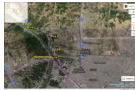
Figure 1: Map of study area and Selected sites ( www.bing.com/maps , 2022).